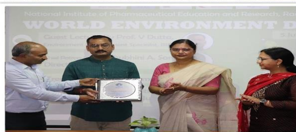
Felicitation by the Director to Guest Speaker

The event was closed by vote of the tanks to all attendees.