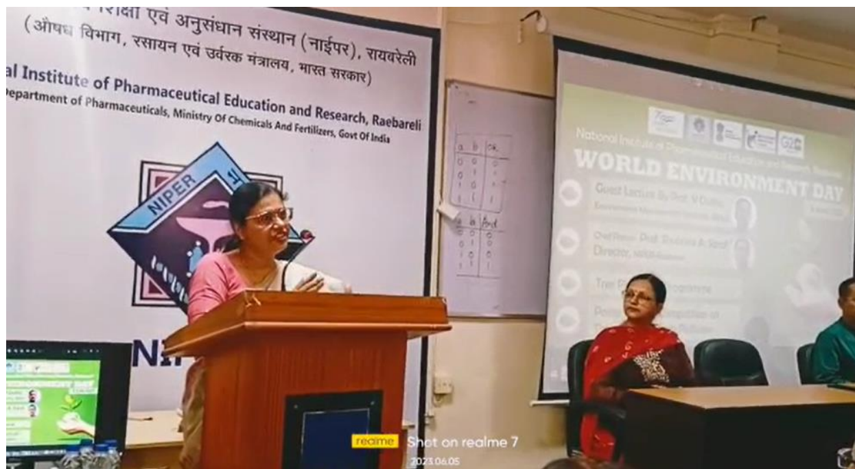
A key inaugural message by the Director, NIPER Raebareli

All faculty, staff, and students attended the event.