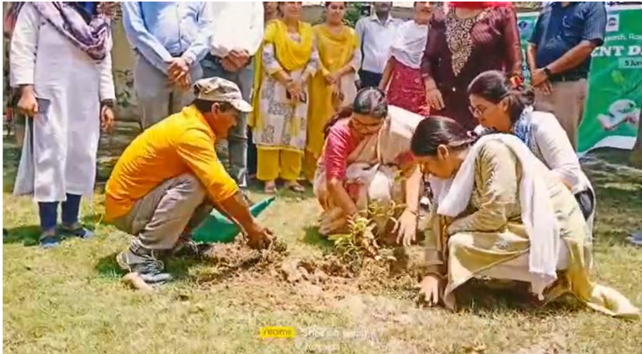
Plantation by the Director, NIPER, Raebareli

A plantation drive was also conducted by the Director, Registrar, Dean, Faculty members, staff, and students on the institute's campus.